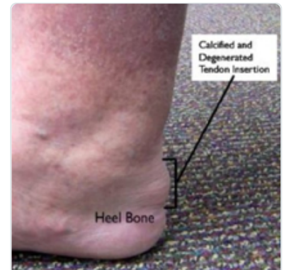
Insertional Achilles tendinitis