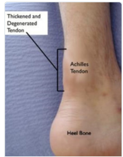
Noninsertional Achilles tendinitis